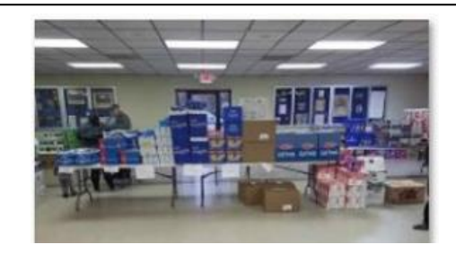
Bulk grocery items unloaded at KC Hall

On Friday December 21<sup>st</sup>, six Brother Knights used several pickup trucks with large flat bed trailers to drive to a local grocer "Save-a-Lot", who provided the lowest overall bid for this bulk purchase of groceries, and they loaded, transported and unloaded these groceries at the KC #1055 Hall for distribution on Saturday, December 22<sup>nd</sup>.