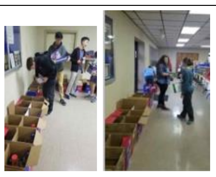
De-bulking by teenaged Santa's helpers.

associated with the local Catholic school, and Family Service Society, assisted Brother Knights with the debulking of the non-perishable groceries from bulk containers to the 94 "baskets" to be distributed on the next day. Hams were purchased from a local business